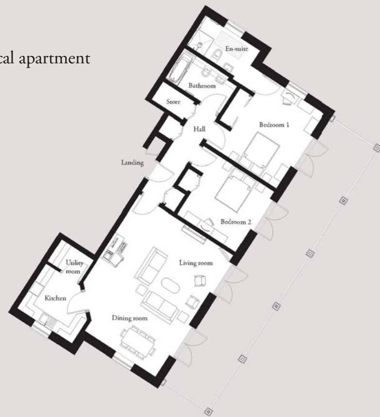
A typical apartment