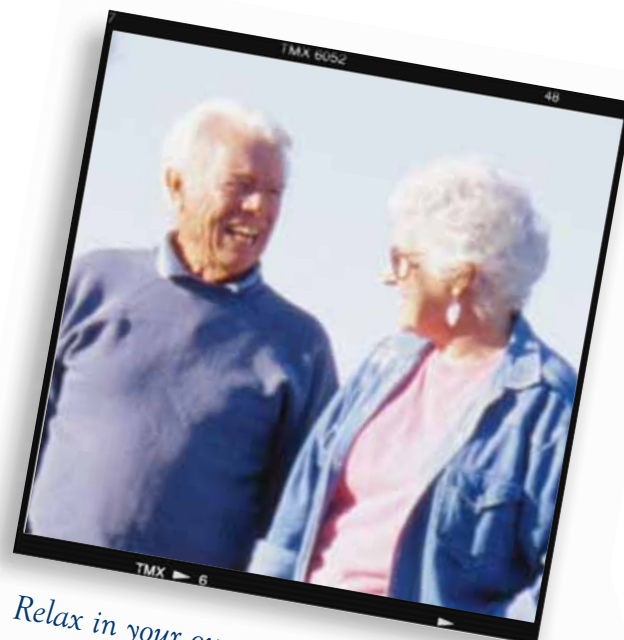
Relax in your own way, your choice