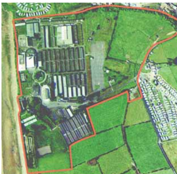
Aerial view of the development 'as now'

You will discover why this was such a successful holiday location in the late 20th Century. There is so much to do for the active yet a calming and beautiful retreat for those just wanting to take it easy.