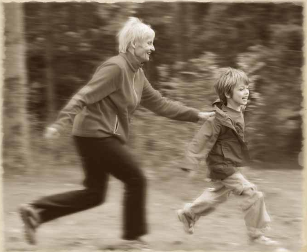
Rush Hour in the Village

You will discover that we have provided more than you could expect. We provide choices for you to consider, helping you enjoy your lifestyle.