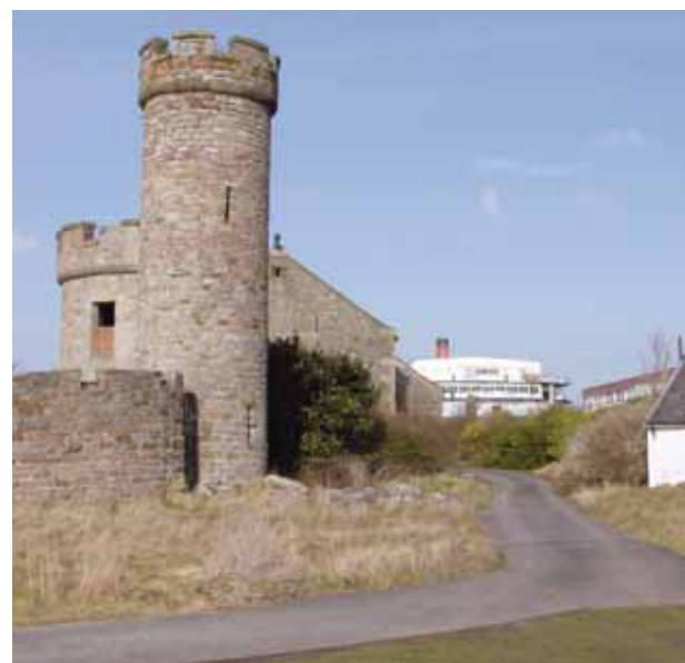
Existing listed building giving 'Middleton Towers' it's original name

"I'm not denying my age, I'm embellishing my youth."