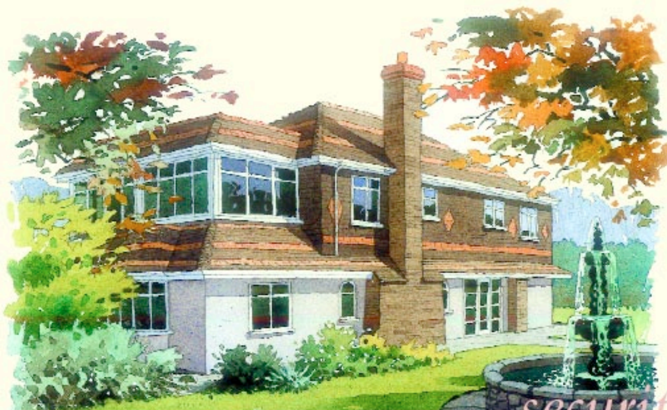
Illustration: Philip Hood