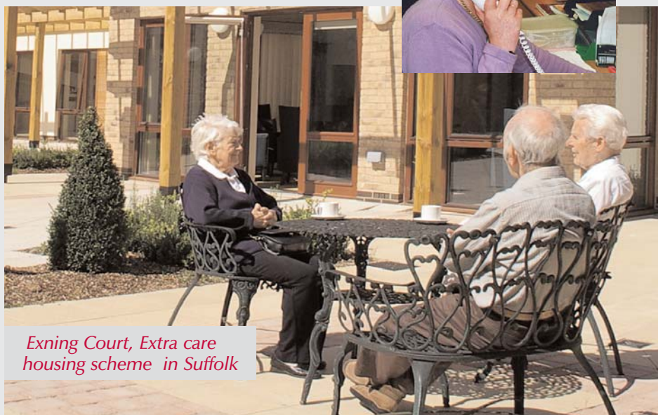
Exning Court, Extra care housing scheme in Suffolk